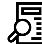
Using sources and interpretations