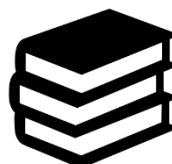
Exposure to Historical Scholarship