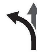
Change and continuity