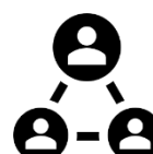
Breadth of diversity