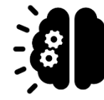
Retrieval and recall